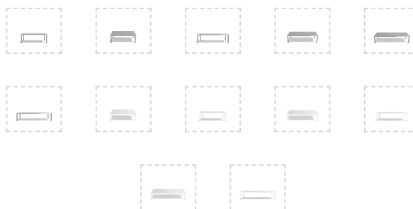
TABLE AND TABLE BASE